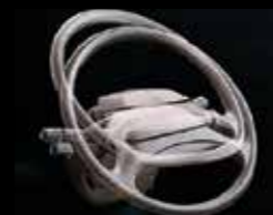
Tilt adjustable steering wheel with collapsible steering column