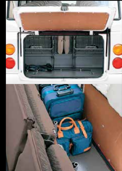
Rear luggage area

Available in • 25-seater (Standard) • 29-seater (Deluxe) • 33-seater (Grand)