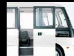
Automatic passenger door