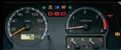
High-contrast meter cluster