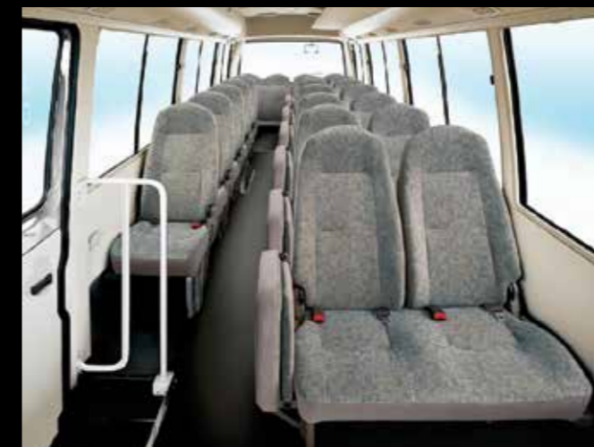
Spacious and relaxing interior with individually reclining seats for each passenger