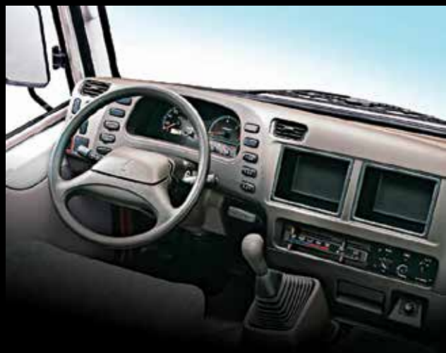
The Rosa features a driver-centric dashboard layout with car-like features