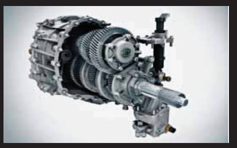
The Fuso FJ is equipped with a smooth-shifting 9-speed manual transmission which provides a higher flexibility of gear selection for various operating conditions thereby enhancing driving performance and improving fuel efficiency