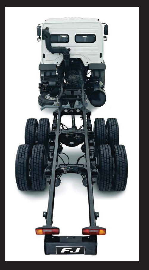
FJ 2528R • Natural 32 ft. Loading Span • Equipped with Flange type P.T.O. (Wing Van optional rear body)