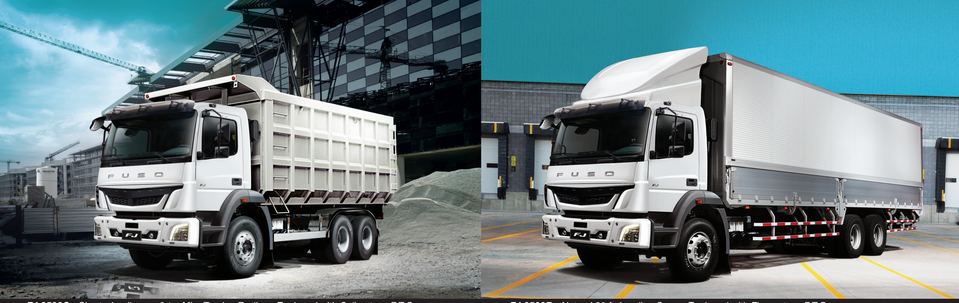
FJ 2528C • Short wheelbase • 8.1m Min. Turning Radius • Equipped with Spline type P.T.O. (Dump optional rear body)