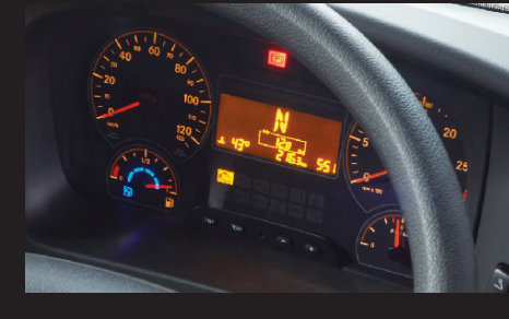
The intelligent meter cluster provides all the necessary information