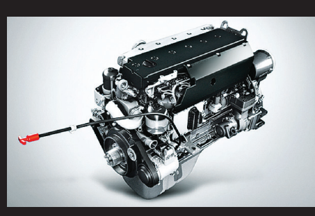
The direct injection diesel engine combines high output and flat torque for power hungry applications