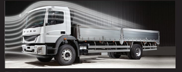
The FJ's aerodynamic cab design reduces wind resistance thus reducing cabin noise while increasing fuel efficiency