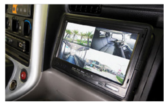
All-around safety. Equipped with front dashcam, rear camera, and front and passenger cabin CCTV cameras.

Mas stable ang biyahe dahil sa dual rear wheels