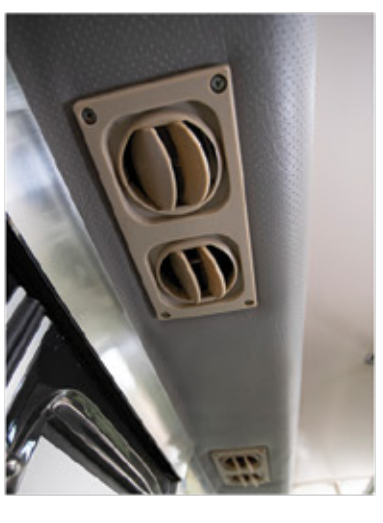
Air-conditioner made for Philippine weather para kumportable ang mga pasahero