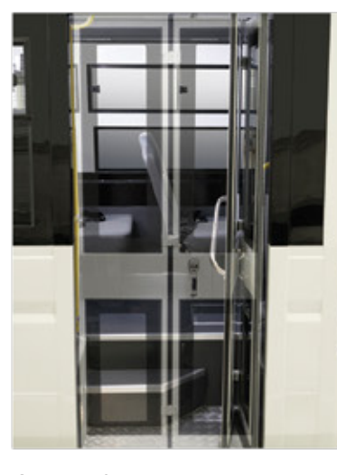
Automatic rear passenger door para sa mas madaling pagsakay at pagbaba ng mga pasahero