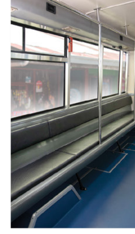
Maluwag na passenger cabin para